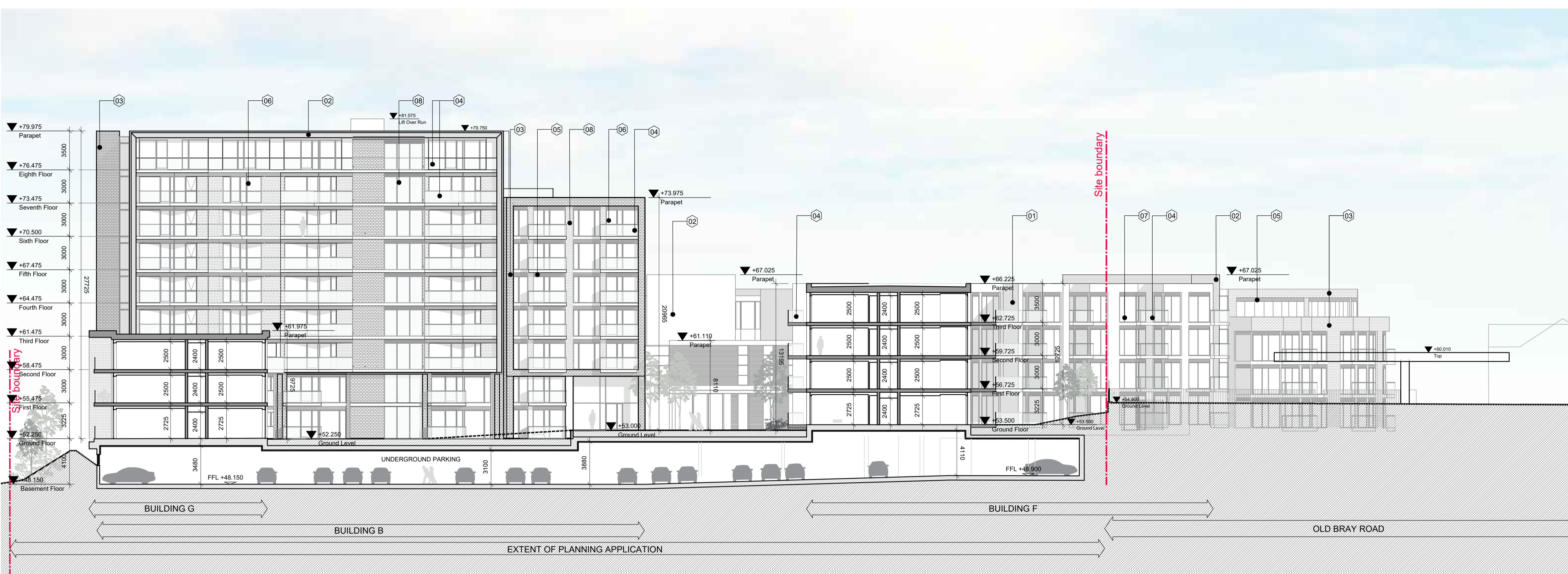
01 PROPOSED WEST ELEVATION 02 SCALE 1:200